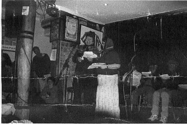
Grannies Growl and Grunt entertain the audience.