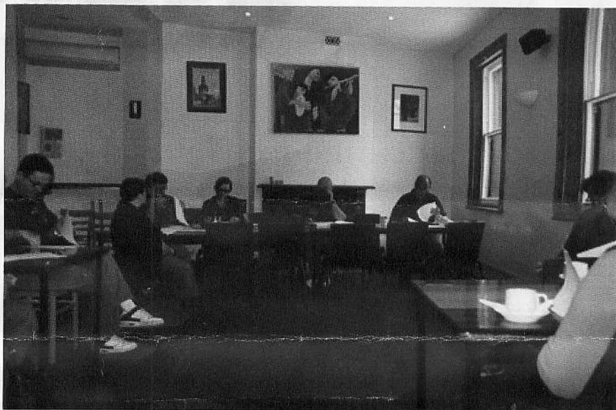
The IAOT 2008 AGM was held at 12 noon, Saturday 8th March at The New Sydney Hotel

Readers are advised that the subscription rates for membership remain as before, viz., $10 per individual aged over 18 years, and $20 for a family membership.